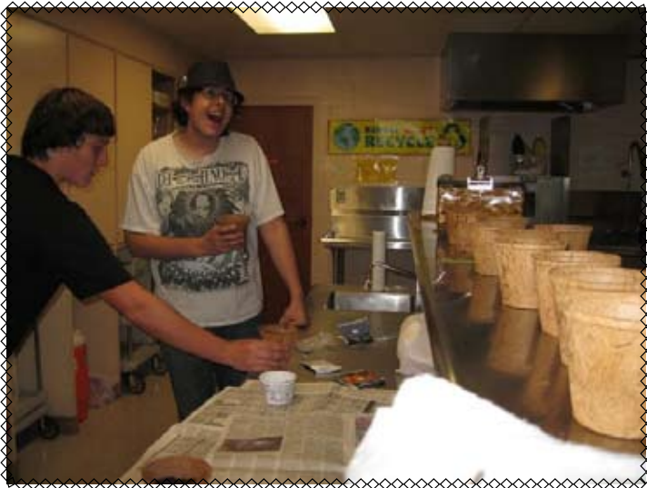
Youth learn about gardening by planting seeds and getting an introduction to worm and compost bins.